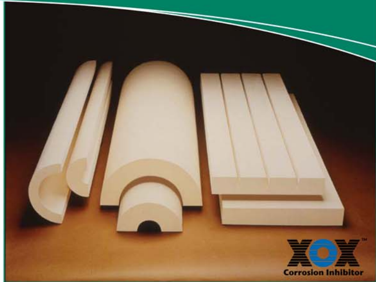
Thermo-12® Gold Operating Temperature Limit: 1200°F (650°C)

Please visit our website at www.iig-llc.com .